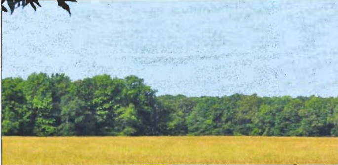
Pasture and Timberland

Directions: From across Highway 70 at Four Seasons Restaurant in New Johnsonville, take Shaver Lane to sale on right and left. See auction signs and arrows.