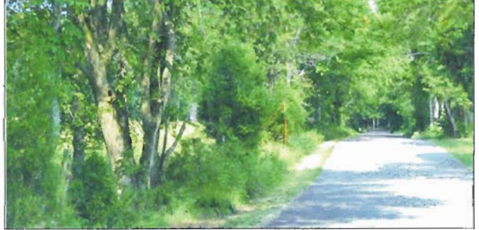
Road Frontage Looking West