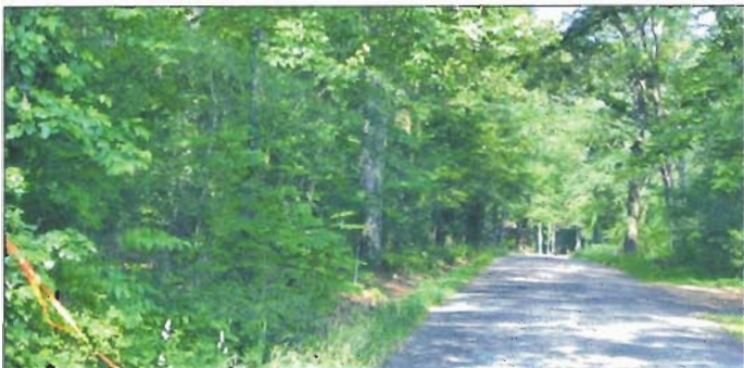
Wooded Road Frontage