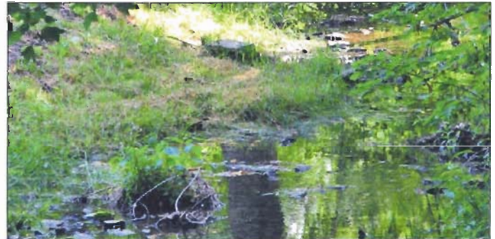
Year Round Stream (Tract 11)

This property will be offered in 11 tracts having 5.01 up to 17.50 acres each. There is a total of 121.12 acres with approx. 75 acres being timberland having merchantable timber. The balance is in permanent pasture and is fenced. Tract #11 has long road frontage and Indian Creek, which is a year round stream, meanders through this tract. City water is available and all tracts have ideal building sites. These tracts are also excellent for hunting wild game such as deer, wild turkeys, etc. Being located approx. 1/4 mile from Four Season's Restaurant, and 2 1/2 miles from Kentucky Lake access, makes this property suitable for many different uses. Come and buy one or all of these beautiful tracts! Sale will be held on site.