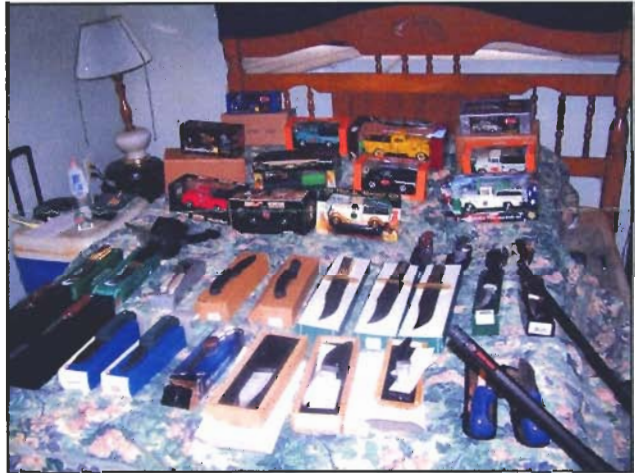
Knives & Collectible Trucks w / Knives