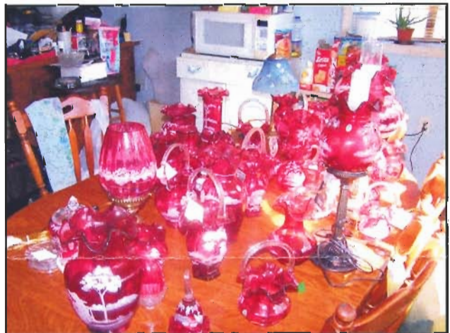
Mary Gregory Limited Edition Fenton Art Glass