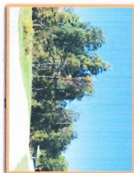
Frontage Old Nashville HWY