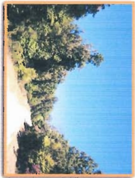
Both sides of Tummins Rd.